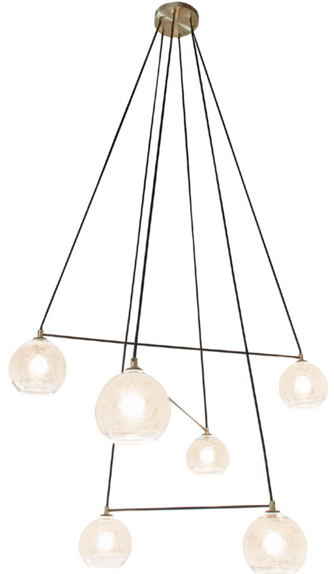
6 light clear round bubble 6' overall drop 56-90-129-6A