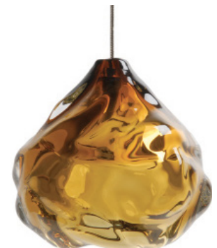
amber 24-56-126 4”T x 4”W