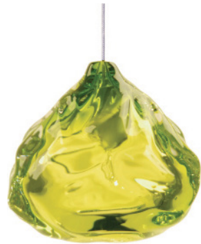
lime green 24-56-89 4”T x 4”W