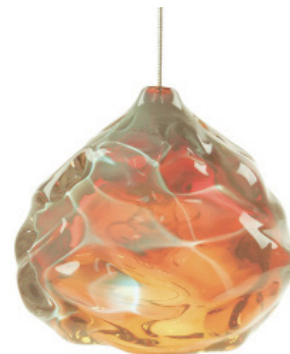
gold topaz 24-56-92 4”T x 4”W