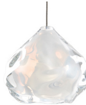
opaline 24-56-101 4”T x 4”W