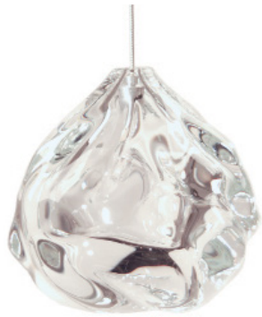
clear 24-56-48 4”T x 4”W