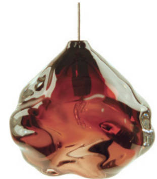
aubergine 24-56-91 4”T x 4”W