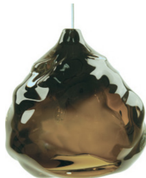
sargasso 24-56-90 4”T x 4”W