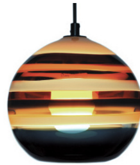
amber orb 25-44-53 9”T x 9”W