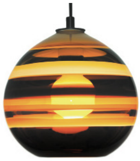
mustard orb 25-44-120 9”T x 9”W