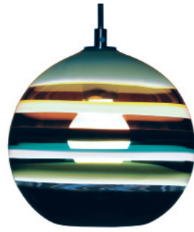
stone orb 25-44-122 9”T x 9”W