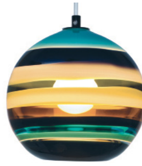
aqua orb 25-44-51 9”T x 9”W