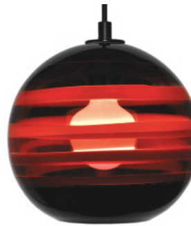
scarlet orb 25-44-54 9”T x 9”W