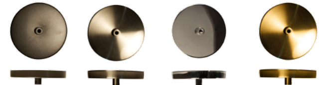
DARK BRONZE -BZ SATIN NICKEL -SN POLISHED NICKEL -PN BRUSHED BRASS -BB

*For pipe and chain options, please view additional options page.