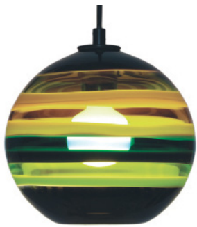
moss orb 25-44-121 9”T x 9”W