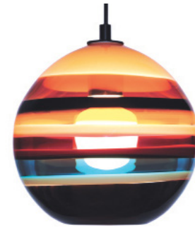
cranberry orb 25-44-41 9”T x 9”W