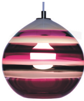
amethyst orb 25-44-52 9”T x 9”W