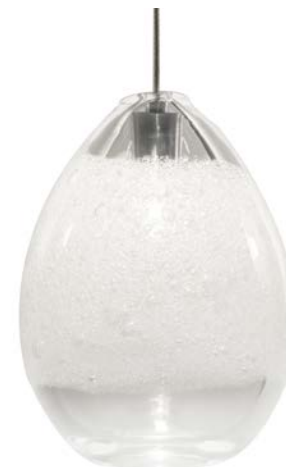
clear bubble egg 24-19-129XS 6”T x 4”W