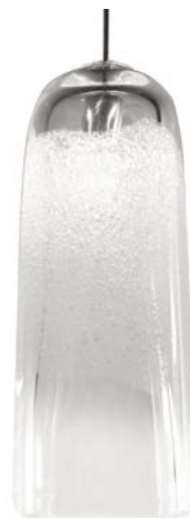
clear bubble square 24-57-129XS 8”T x 3.5”W