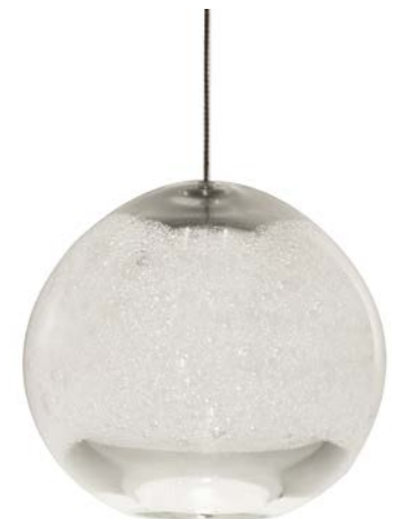
clear bubble orb 24-44-129XS 4.5”T x 4.5”W