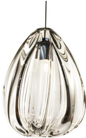
clear barnacle 24-58-48XS 7”T x 5.5”W