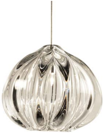
clear urchin 24-59-48XS 4.5”T x 6”W