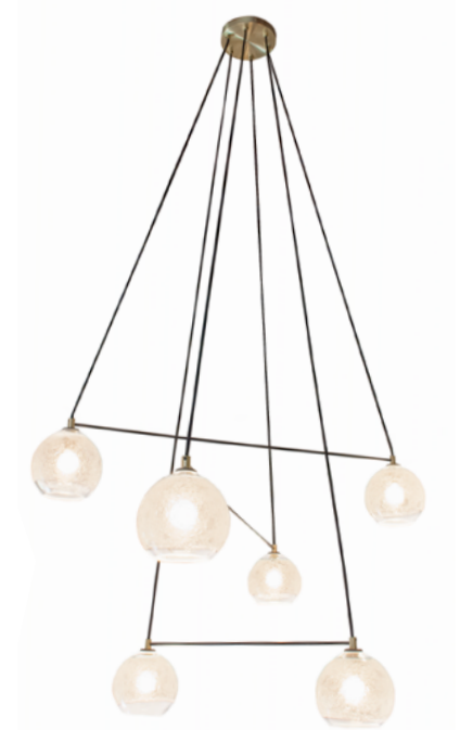
6 light clear round bubble crossbar lengths 2', 3', and 4' 56-90-129-6A 4.5' minimum drop as shown