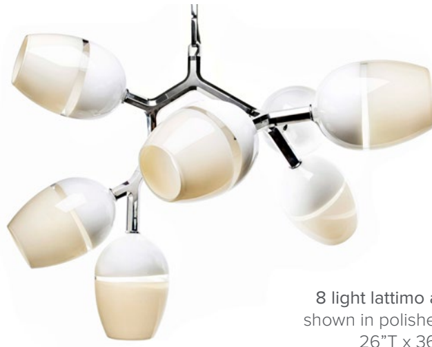
8 light lattimo antler chandelier shown in polished aluminum finish 26”T x 36”W x 28”D