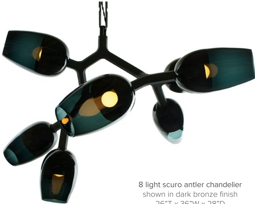
8 light scuro antler chandelier shown in dark bronze finish 26”T x 36”W x 28”D